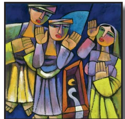
“The Empty Tomb” by Dr. He Qi from Seasonals: Lent