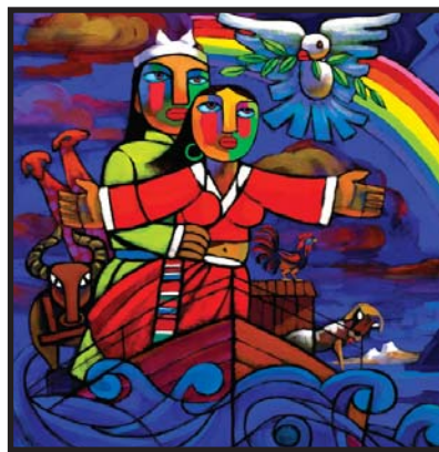
“Ark of Noah” by Dr. He Qi from Seasonals: Advent